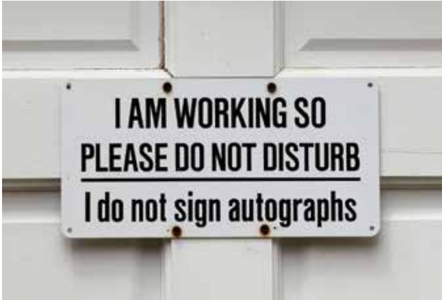
A sign on door bids visitors to not disturb.

where others saw only the horror of her disability and the squalor of her household. 1 Once when he brought the actor Robert Montgomery to meet Christina in the squalid kitchen in which she was confined, Montgomery fled outside and vomited after just a few minutes inside. 1 Wyeth never judged Christina by what he saw and, for this, he was the only one allowed to roam freely through her life and her once grand house. 1