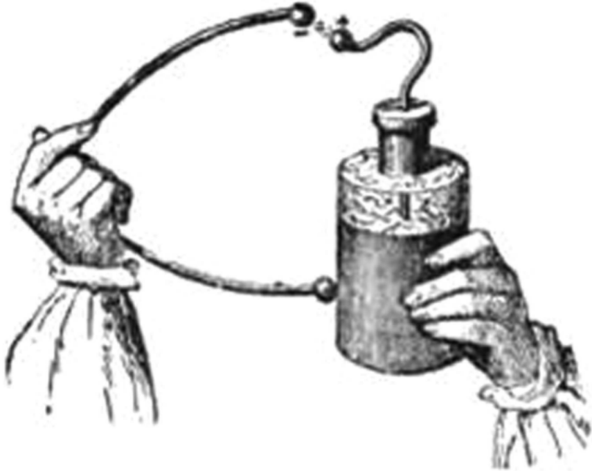
FIG. 2. Drawing of an early Leyden jar.

are performed on patients arresting outside of the hospital, more than a quarter survive long enough to be admitted to a hospital (9–12). Given these statistics, approximately 125,000 lives could be saved each year if defibrillators were widely available and the general public properly trained in CPR techniques. In the hospital, where in developed countries 1 to 5 patients of 1000 has a cardiac arrest, CPR brings fewer victims back to life (only 14% to 22% by some estimates), but because hospitalized patients are generally sicker than their outpatient counterparts, one would expect them to have poorer outcomes (13–16).