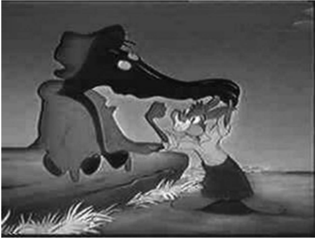
FIG. 6. Scene from Walt Disney's "Tar-Baby" cartoon.

our ability to relieve suffering and extend life seems limitless. However, in all too many instances, rhetorical strategies are used to exaggerate these miracles. Findings are called evidence (a term connoting proof), rather than data (a neutral term), when proof is only rarely the outcome of clinical investigations. Ratios, rather than absolute values, are used to report outcomes to give the appearance of greater treatment effects than are actually achieved. Complications are underreported. Too often treatment benefits are highlighted even in trials with statistically insignificant results; and when statistical significance is achieved, too often it trumps clinical significance. Interventions are said to save lives, when, at best, they simply extend lives long enough for patients to die of some disorder other than the one being studied. Clinical investigators rarely report the number of extra years their interventions add to patients' lives. Nor do they consider the possibility that the decrease in mortality from the disease being treated simply reflects an increase in mortality due to some other disorder for which the treatment might be responsible (30).