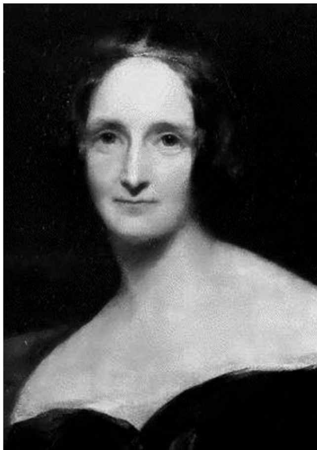
FIG. 1. Richard Rothwell's 1840 portrait of Mary Shelley.

vocal but eloquent. It begins life as a sensitive, caring being, but because of its hideous appearance, it is forever shunned. The more it is excluded, the more it envies, the more it destroys, the more it is excluded (4). It is mortal, and at the end of the book, after having destroyed its creator, the monster disappears into the arctic ice field "to sleep in peace."