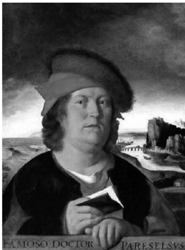
FIG. 5. Copy of a lost 17th century portrait of Paracelsus by Quentin Massys.

In the aggregate, such chemicals (i.e., drugs) almost certainly cause more harm to our patients than almost anything we do to them. An